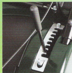
Single lever height of cut adjustment.