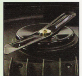
Friction disc crankshaft protector